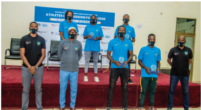
Beach Volleyball, Karate and Cycling Athletes posing for a group photo after receiving their awards.