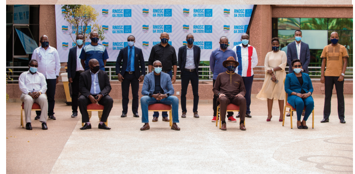
Group photos of the RNOSC Members at its Ordinary General Assembly 2020 held on the 11th of October.