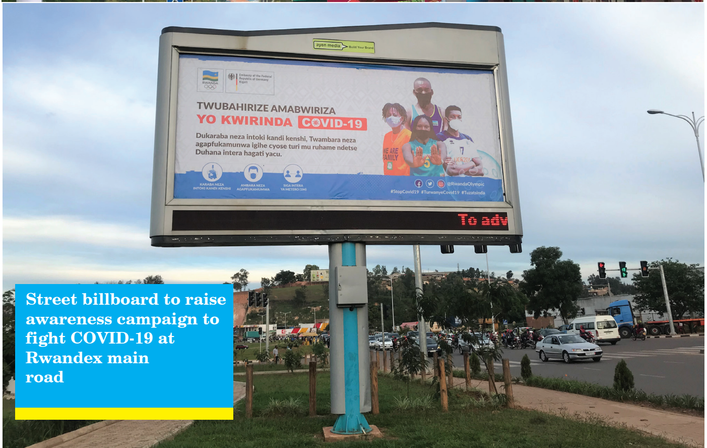
Street billboard to raise awareness campaign to fight COVID-19 at Rwandex main road