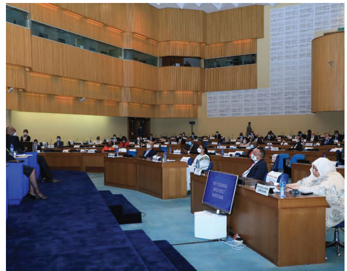
Participants at the 2020 ANOCA Extraordinary General Assembly.