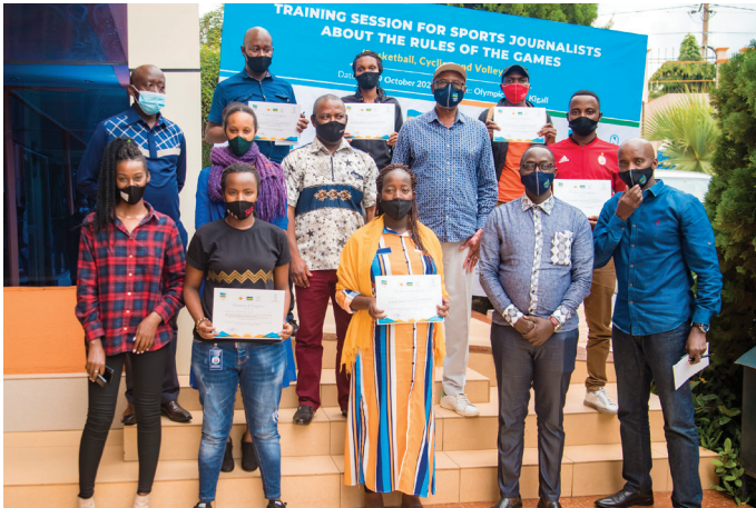
Group photo of some participants after the closing ceremony.

The Rwanda National Olympic and Sports Committee in partnership with the Basketball, Cycling and Volleyball Federations hosted a training session for Rwandan Sports Journalists about the Rules of the Games.