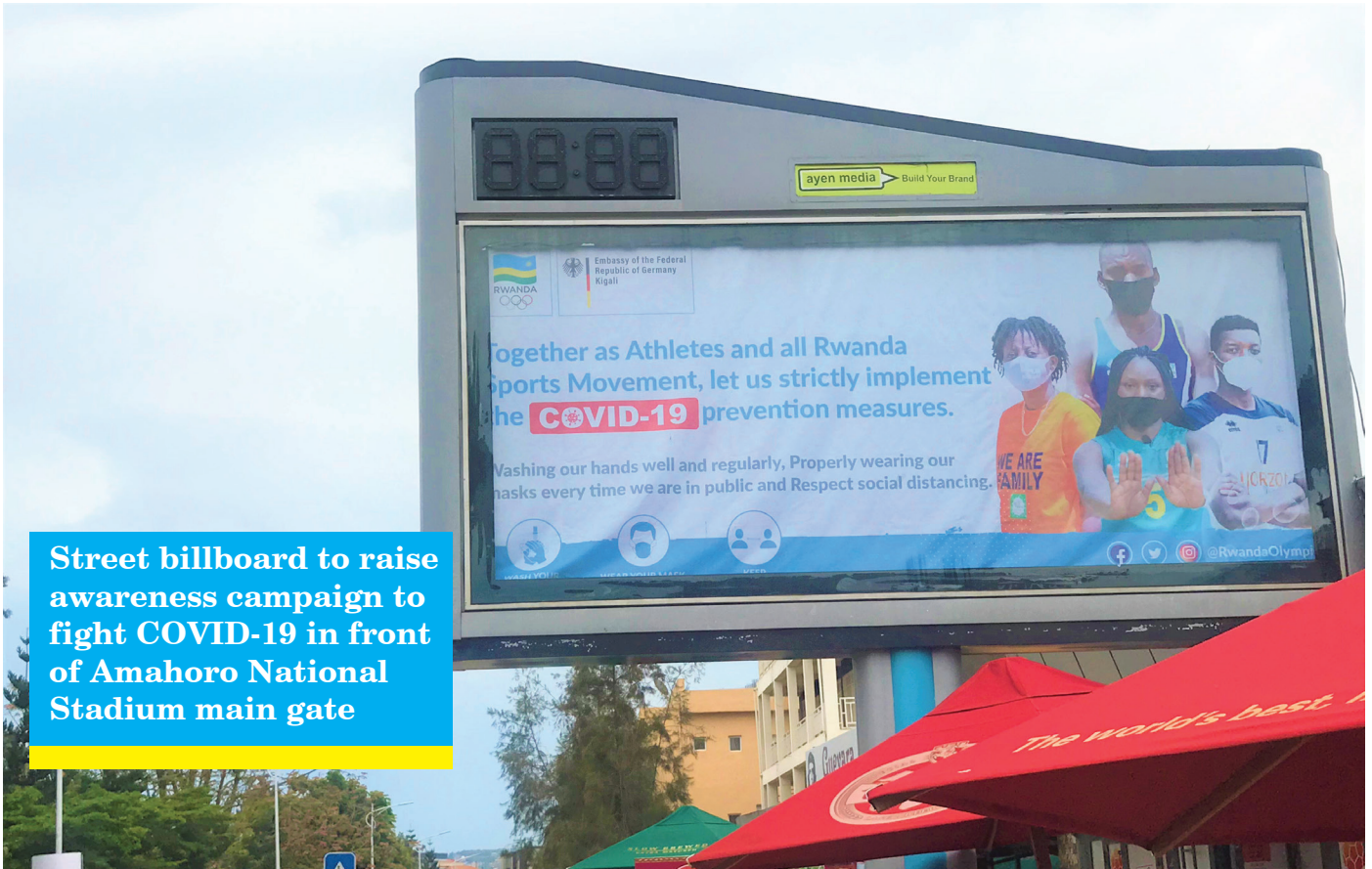
Street billboard to raise awareness campaign to fight COVID-19 in front of Amahoro National Stadium main gate

https://www.youtube.com/watch?v=i5NtDXISS-Ww&list=PL86FC8x7PA6no-iZL54qNrVBgEbmns-s9F