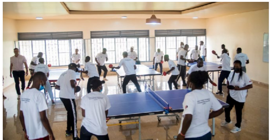
Participants learning through practice.

opportunity to internally compete to deeply understand what they have learned through actions.