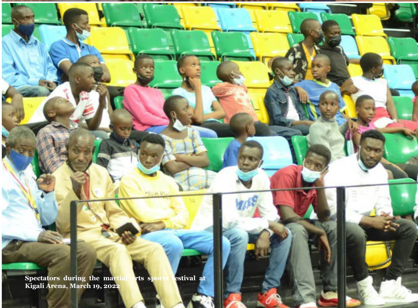
Spectators during the martial arts sports festival at Kigali Arena, March 19, 2022