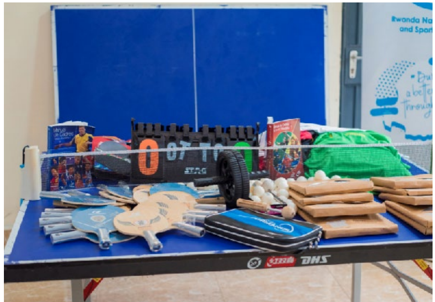
Table Tennis equipment donated to Table Tennis Federation.

and the Ministry of Sports for their partnership to make this happen."