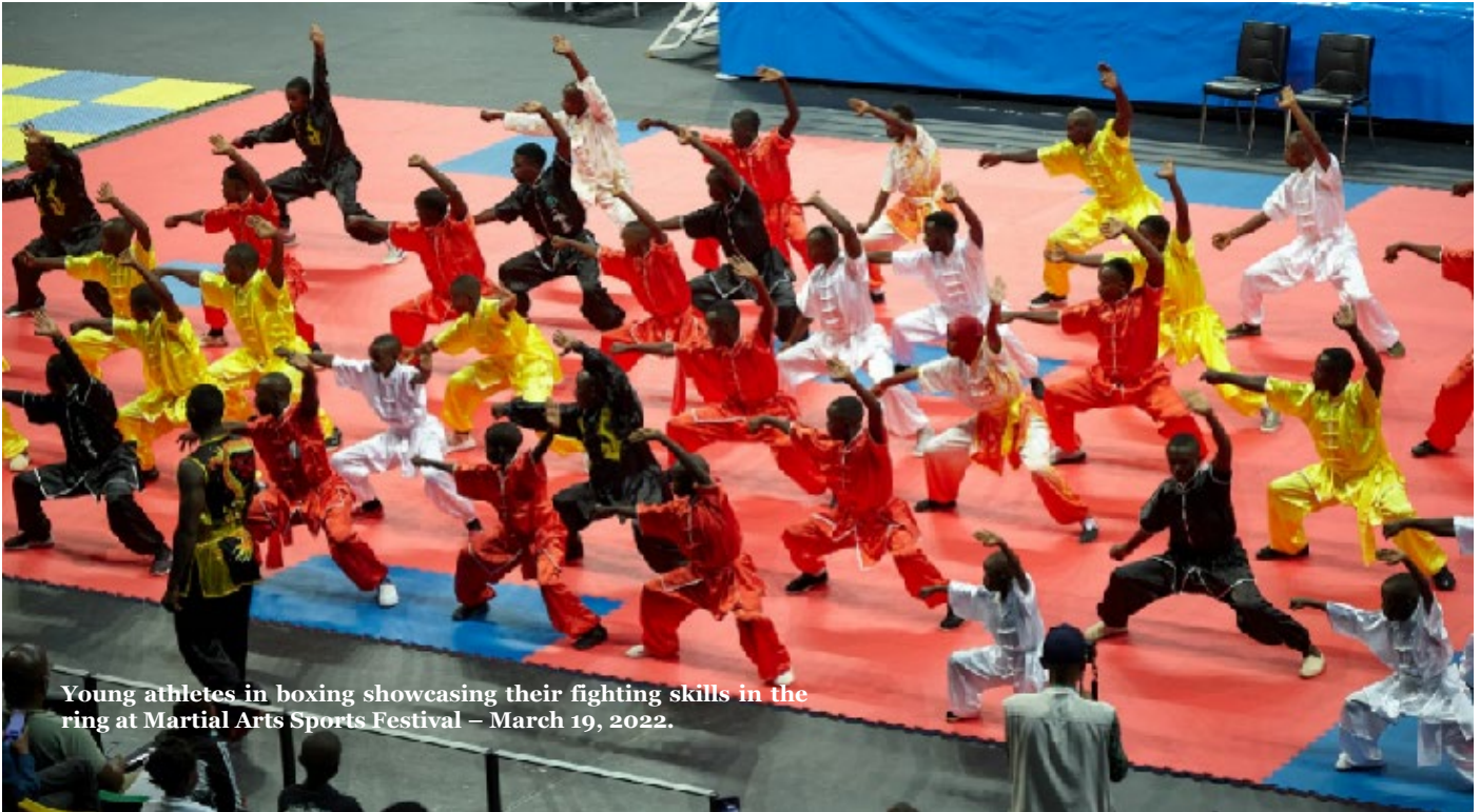
Young athletes in boxing showcasing their fighting skills in the ring at Martial Arts Sports Festival – March 19, 2022.

Kung-Fu and Wushu, and Boxing participated and showcased their uniqueness through brilliant performances by seniors, juniors and children who entertained a full house of spectators at Kigali Arena.