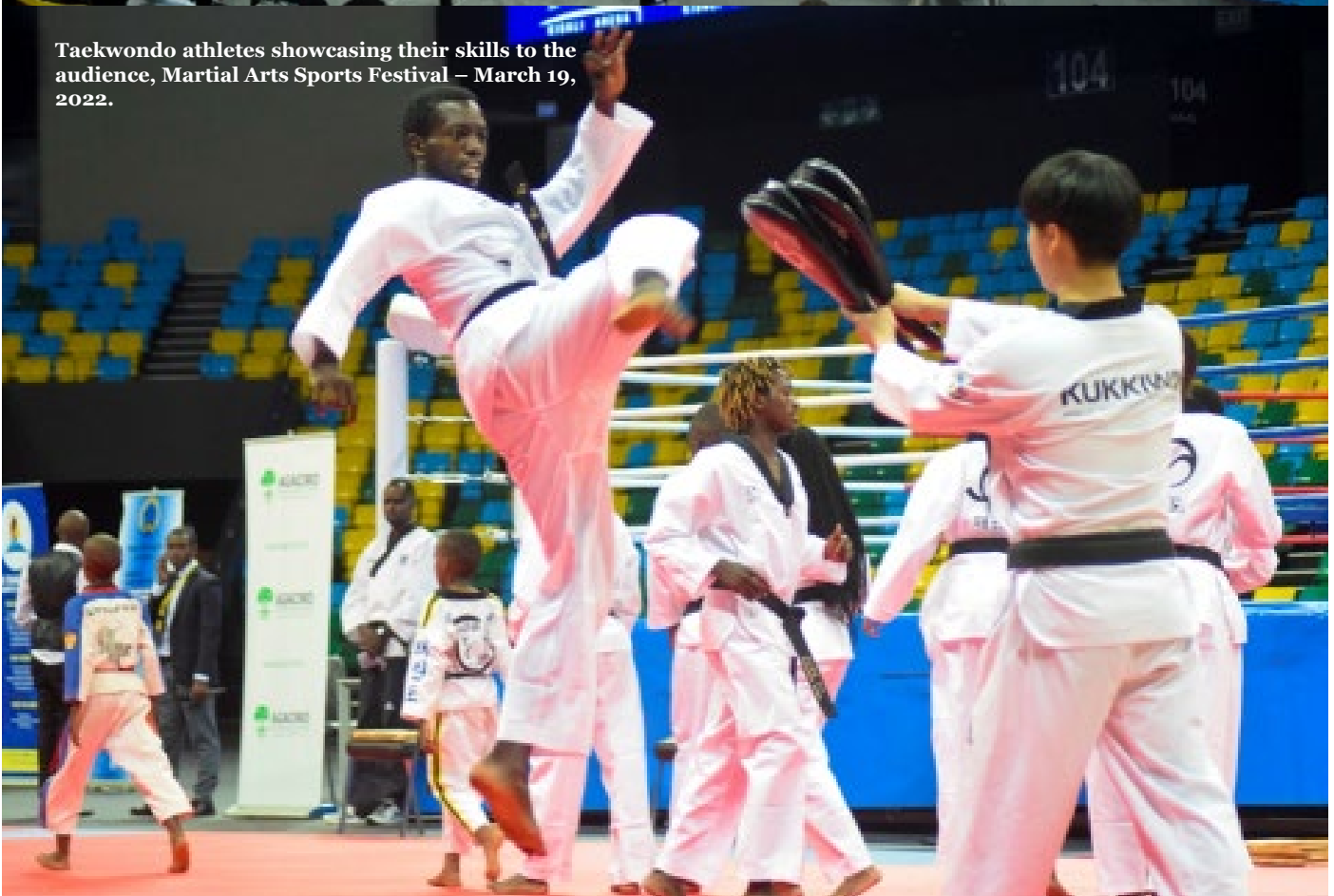
Taekwondo athletes showcasing their skills to the audience, Martial Arts Sports Festival – March 19, 2022.