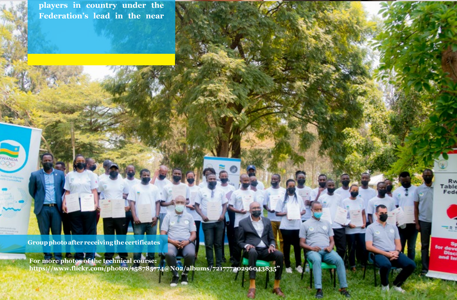
Group photo after receiving the certificates

For more photos of the technical course: https://www.flickr.com/photos/158785774@N02/albums/72177720296043835 ”