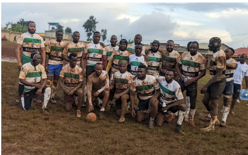
Lions de Fer RFC iyoboye urutonde muri rusange